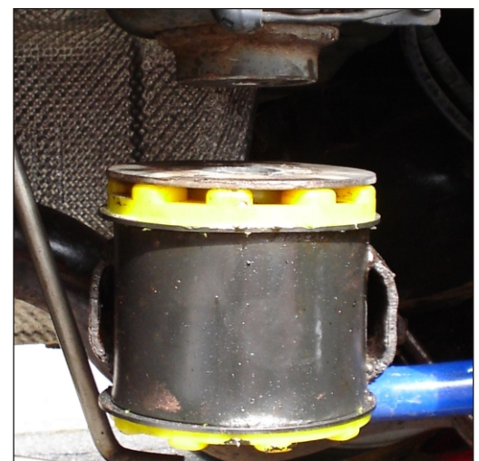
Fig 2. Rear mount - OE washers shown.